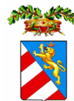
Provincia di Gorizia