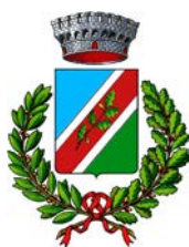
Comune di Doberdò